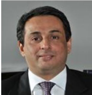
Mr. T.V. Narendran

Mr. T V Narendran is a mechanical engineer from REC (NIT), Trichy and an MBA from IIM Calcutta. Currently, he is CEO & MD of Tata Steel Ltd. He is having more than 30 years of experience in metal and mining industry. He has extensive experience in many areas including Marketing & Sales, International Trade, Supply Chain, Planning, Operation & General Management, in India and abroad. In 2005, he was actively involved in the Tata Steel's first overseas acquisition, NatSteel and played a key role in its integration with Tata Steel. Eventually, he led the operations in NatSteel and took over as its President & CEO on January 1, 2008. Mr. Narendran was appointed as the Managing Director (India & South-East Asia) in November, 2013. During his tenure, Tata Steel has successfully executed and commissioned one of the largest greenfield projects in India – The Kalinganagar Steel Plant in Odisha and also enhanced its ability to deliver to higher value segments like steel for automobiles. He is a part of various prestigious organization both at global and Indian level, namely Executive Committee of the World Steel Association, National Council of CII, BRICS Business Council, India Myanmar Joint Trade & Investment Forum, etc.